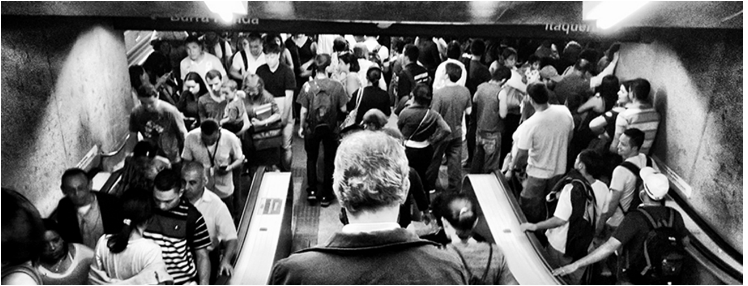
Figure 1. Sociologists study how society affects people and how people affect society.