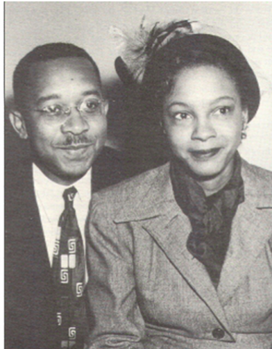
Figure 9. The research of sociologists Kenneth and Mamie Clark helped the Supreme Court decide to end “separate but equal” racial segregation in schools in the United States.

Since it was first founded, many people interested in sociology have been driven by the scholarly desire to contribute knowledge to this field, while others have seen it as a way not only to study society but also to improve it. Besides desegregation, sociology has played a crucial role in many important social reforms, such as equal opportunity for women in the workplace, improved treatment for individuals with mental handicaps or learning disabilities, increased accessibility and accommodation for people with physical handicaps, the right of native populations to preserve their land and culture, and prison system reforms.