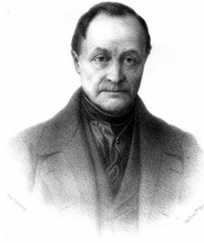
Figure 5. Auguste Comte played an important role in the development of sociology as a recognized discipline.