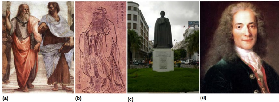
Figure 4. People have been thinking like sociologists long before sociology became a separate academic discipline: Plato and Aristotle, Confucius, Khaldun, and Voltaire all set the stage for modern sociology.

they belong. Many topics studied in modern sociology were also studied by ancient philosophers in their desire to describe an ideal society, including theories of social conflict, economics, social cohesion, and power ( Figure 4 ). 7