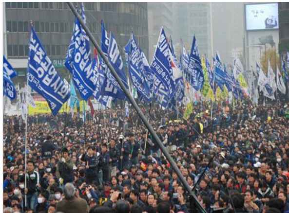
Figure 7. Sociologists develop theories to explain social occurrences such as protest rallies.

Sociologists study social events, interactions, and patterns, and they develop a theory in an attempt to explain why things work as they do ( Figure 7 ). In sociology, a theory is a way to explain different aspects of social interactions and to create a testable proposition, called a hypothesis , about society. 20