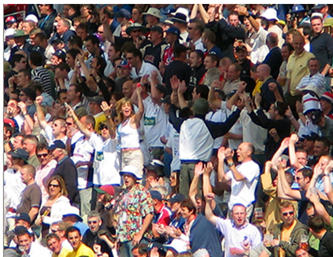
Figure 2. Sociologists learn about society as a whole while studying one-to-one and group interactions.

One illustration of this is a person's decision to marry. In the United States, this choice is heavily influenced by individual feelings; however, the social acceptability of marriage relative to the person's circumstances also plays a part. Remember, though, that culture is a product of the people in a society; sociologists take care not to treat the concept of "culture" as though it were alive in its own right. Reification is an error of treating an abstract concept as though it has a real, material existence. 2