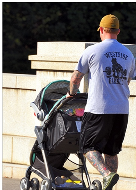
Figure 3. Modern U.S. families may be very different in structure from what was historically typical.

Changes in the U.S. family structure offer an example of patterns that sociologists are interested in studying ( Figure 3 ). A “typical” family now is vastly different than in past decades when most U.S. families consisted of married parents living in a home with their unmarried children. The percent of unmarried couples, same-sex couples, single-parent and single-adult households is increasing, as well as is the number of expanded households, in which extended family members such as grandparents, cousins, or adult children live together in the family home. 3